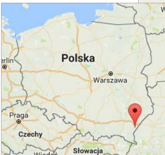
Our location in Poland